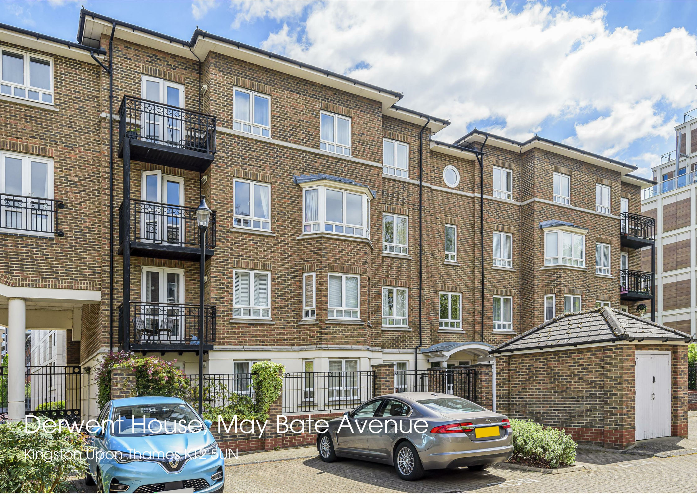
Derwent House, May Bate Avenue Kingston Upon Thames KT12 5UN

34 Richmond Road Kingston upon Thames Surrey KT12 5ED www.gibsonlane.co.uk Tel: 020 8546 5444